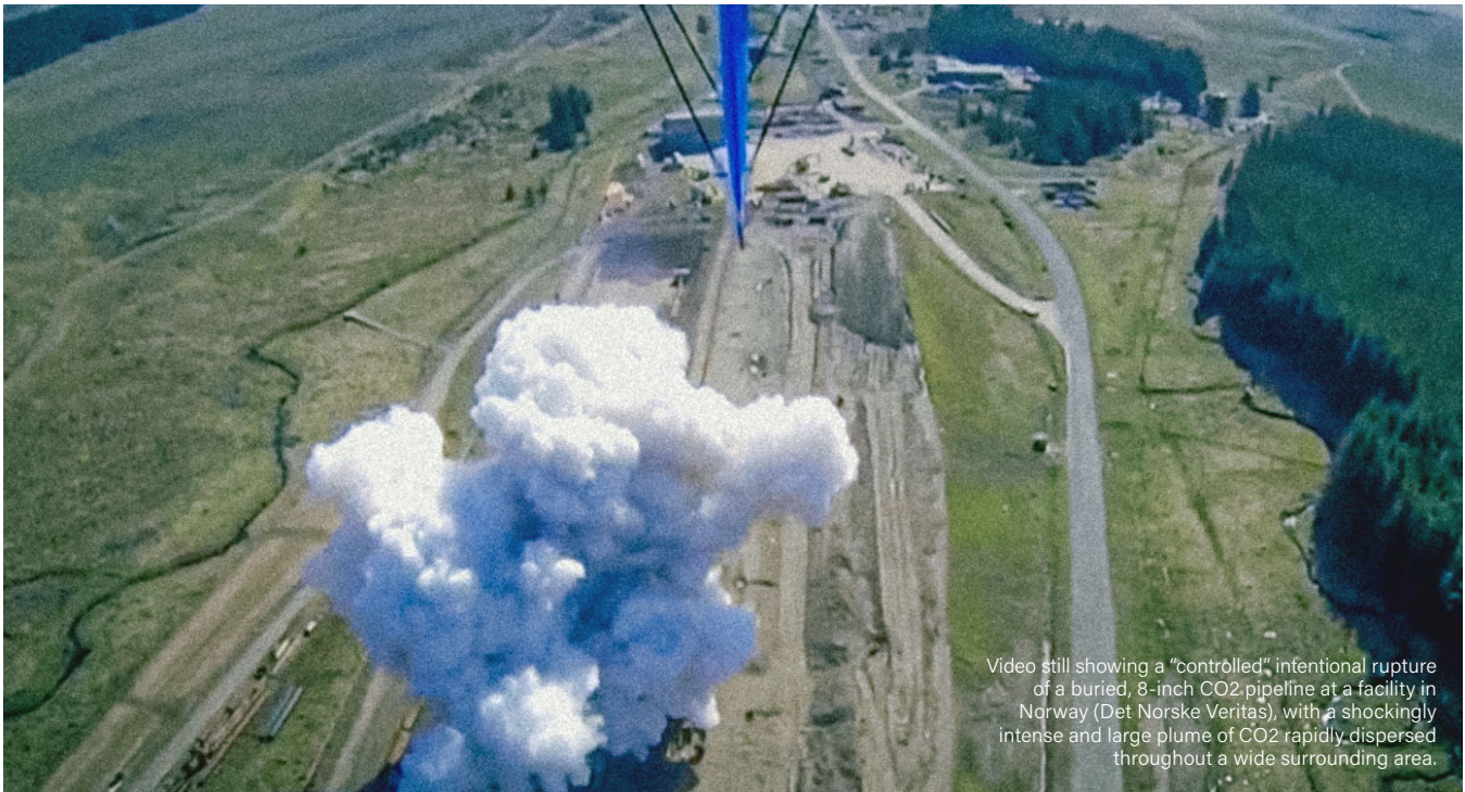
Video still showing a "controlled" intentional rupture of a buried, 8-inch CO2 pipeline at a facility in Norway (Det Norske Veritas), with a shockingly intense and large plume of CO2 rapidly dispersed throughout a wide surrounding area.