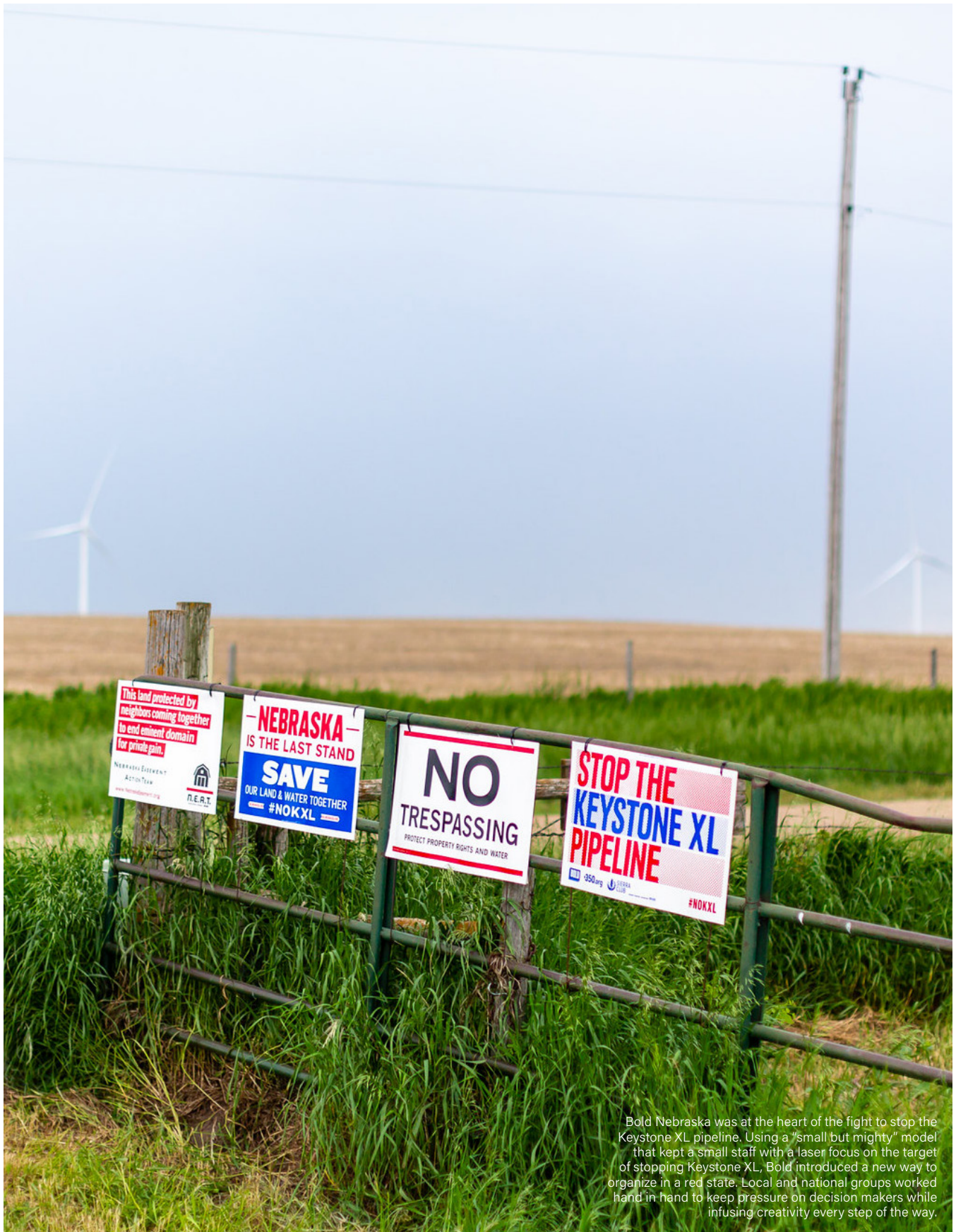
Bold Nebraska was at the heart of the fight to stop the Keystone XL pipeline. Using a “small but mighty” model that kept a small staff with a laser focus on the target of stopping Keystone XL, Bold introduced a new way to organize in a red state. Local and national groups worked hand in hand to keep pressure on decision makers while infusing creativity every step of the way.