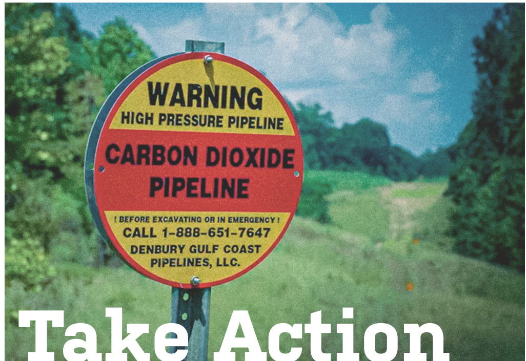
A CO2 gas pipeline in Satartia, Mississippi.